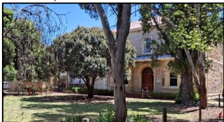
Wattle St Malvern from 1980

The Bible College relocated to Wattle St, Malvern in 1980.