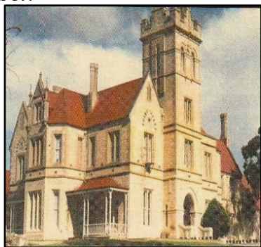
Mt Breckan 1962 to 1979

By 1962 the College at Payneham needed extension, but instead after much prayer it was miraculously possible to buy the very large property of Mt Breckan at Victor Harbor.