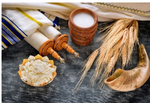
Shavuot (Pentecost): The Feast of Weeks

50 days after Passover, every year, they celebrated PENTECOST, commemorating the end of harvest – God’s faithfulness in providing their food for the next 12 months. A very practical HELP, coming directly from the LORD. We sow in FAITH, but the Lord brings the increase in His FAITHFULNESS.